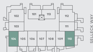
PARCEL 2 LOWER