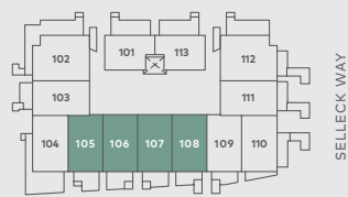
PARCEL 2 LOWER