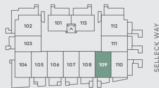
PARCEL 2 LOWER