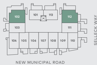
PARCEL 2 LOWER