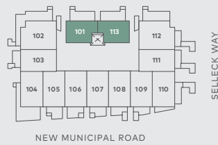
PARCEL 2 LOWER